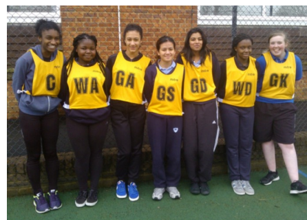
Year 11 Netball Team