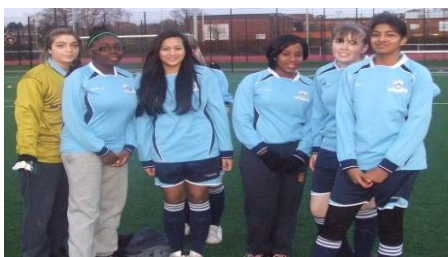
Year 9 and 10 Football Team

Year 7, 8 and 9 have taken part in the Reading Schools' 6-a-side Football League. All our teams have had some close matches with some excellent skills on display. The Year 7 and 8 B-team qualified for the semi-finals.