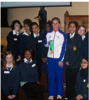
Students with Anna Hemmings MBE – Olympic Medallist and World Kayak Champion.

In October a group of students from Years 8, 9 and 10 attended an event on Student Leadership & The 2012 Games at St Crispin's School in Wokingham. This will enable them to represent the students and work with staff to plan events in school to increase awareness of the Olympic Games in London 2012 and the Olympic themes and values. Some of their ideas have already been taken on board by the school and events will be taking place in the summer.