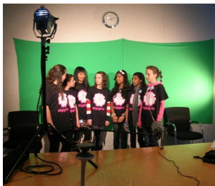
In front of the green screen—lights ... camera ... action!

Students were split into teams and were asked to make a pilot for a new programme using new Microsoft technology. They wrote a script and acted it out in front of a 'green screen'.