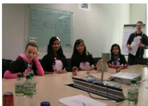
Ideas gathering and script conference followed by rehearsal.

In November, 19 students from Year 8 took part in Microsoft's Digirlz event. This event is held at Microsoft locations worldwide and is designed to provide secondary school girls with a better understanding of what a career in technology is all about and to see first hand any new technology designs.