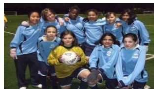
Year 7 Football Squad

Years 7, 8 and 9 have taken part in the Reading Schools' 7-a-side Football Tournaments this term and have now started their league matches. All our teams have had some close matches with some excellent skills on display.