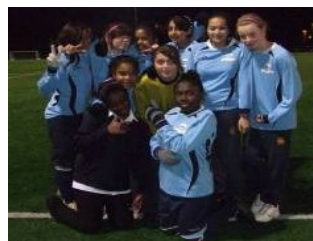
Year 9 Football squad